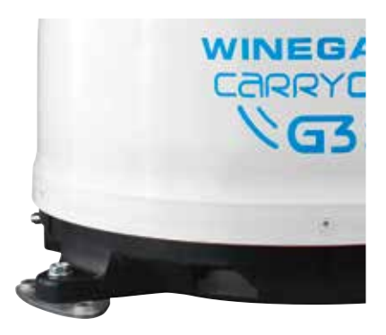
Carryout G3 antenna, with RK-4000 Roof Mount Kit